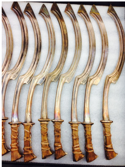
Game of Thrones