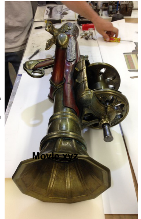
Avengers: Age of Ultron