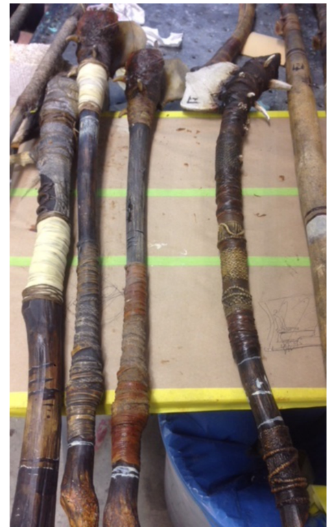
War for the Planet of the Apes