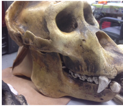
War for the Planet of the Apes