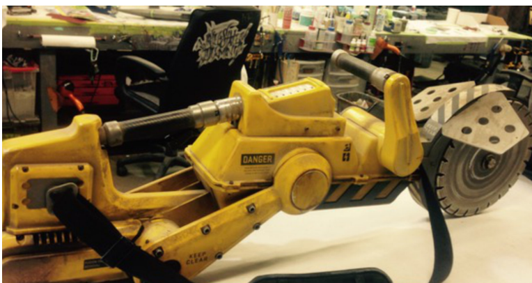
Independence Day: Resurgence

Cell: 818.618.6384 Email: ben@corycollection.com