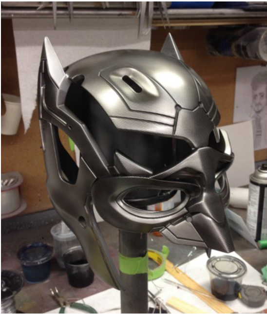
Batman v. Superman: Dawn of Justice