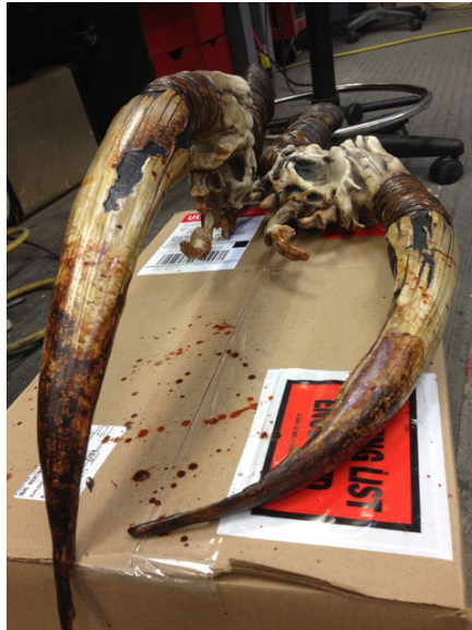
War for the Planet of the Apes