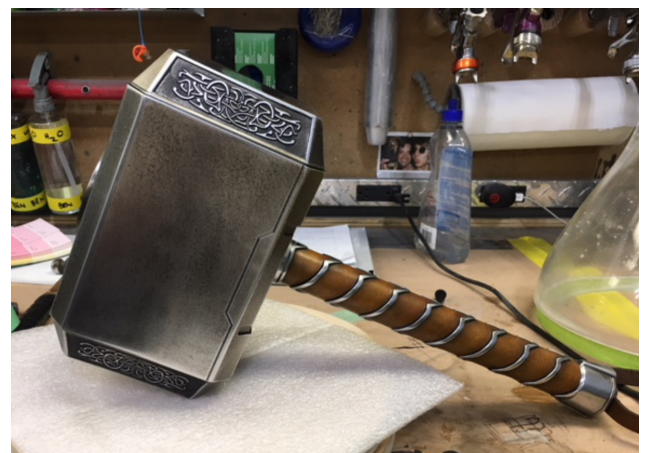
Avengers: : Age of Ultron