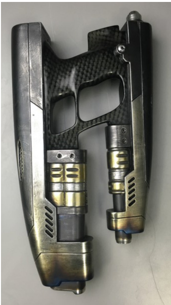
Guardians of the Galaxy