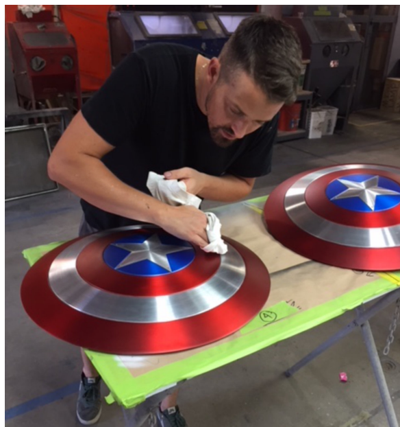
Avengers: Age of Ultron